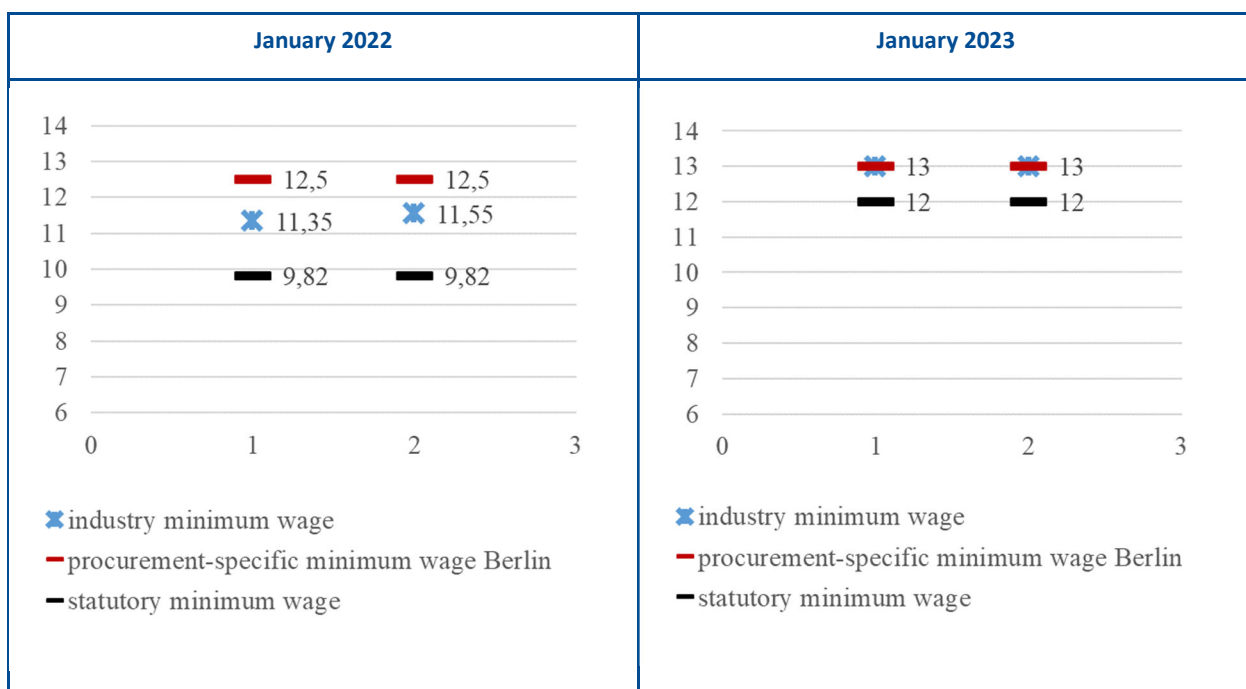
Figure 2-2 Industry minimum wages, national minimum wage, procurement-specific minimum wage

The strong increase of the national minimum wage in October 2022 was inspired by the same ambition, i.e. to raise the minimum wage to a level closer to what can be considered as a ‘living wage’. After this strong raise, the question is again on the agenda whether there will be a role in the future for a separate procurement specific minimum wage. So far, at € 13, the one on Brandenburg and Berlin is above the level of the new national minimum wage. It is however not any longer above the level of the industry specific minimum wages in both the cleaning industry and in security services (see figure 2-2 below).