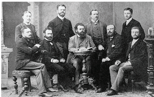
FIGURE 1. SVANTE ARRHENIUS and Ludwig Boltzmann's group in Graz, Austria, 1887. Boltzmann sits in the center, Arrhenius stands behind him on the right, and Walther Nernst stands at the far left.

Those advantageous properties of the Arrhenius plot recently came to mind in a discussion with a colleague about the harm-