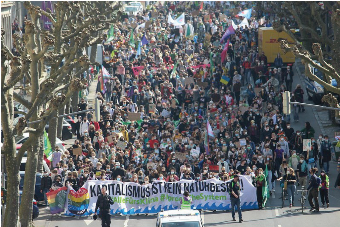
Figure 1: a picture conveying a sense of scale of a FFF protest

ments, are significant visual events for the climate initiative. In other words, they play an important role for the activism of FFF. Research has shown that these mass demonstrations have a pronounced impact on the attention of the general public on the issue of climate change (Sisco et al. 2021). For instance, seeking information about climate change on the internet has increased significantly since 2019, when global mass protests reached their peak. These mass protests, hence, draw enormous attention to the issue of climate change. Even though the heightened attention seems to be short-lived, the mass rallies generate a global awareness comparable to international political events such as the United Nations Climate Change Conferences (ibid. 5–6). Images arguably help to convey a sense of scale of these climate protests.