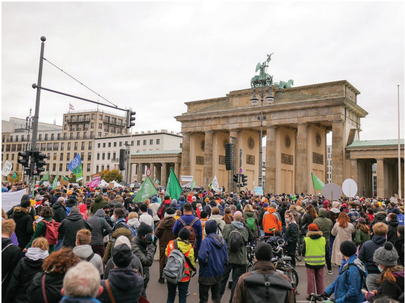
Figure 2: protest taking place in urban space

(Sezer 2020). Thus, the visibility of specific groups in public space is also a political issue.