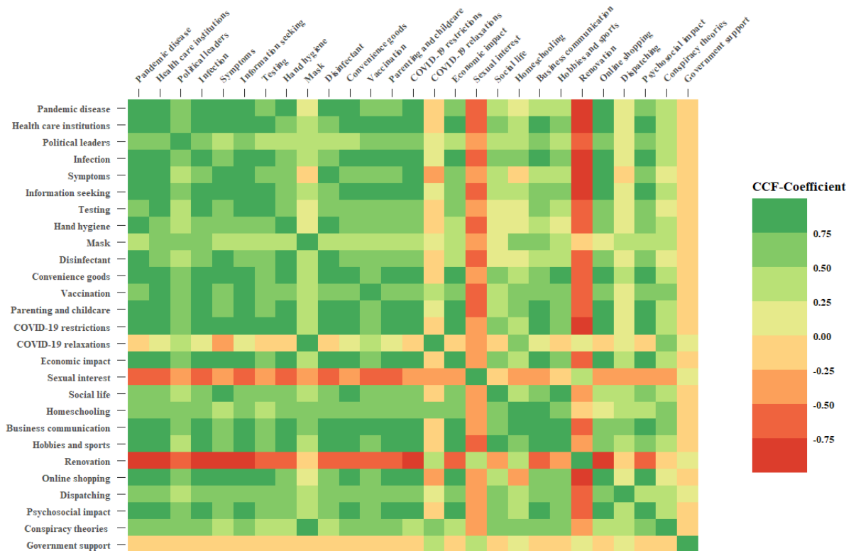
Figure 1. Heat map of cross-correlations for all 27 domains for Germany only. The lower triangle shows concurrent cross-correlations. The upper triangle shows maximal correlations obtained when the time series of one domain was shifted across a range from 0 to 21 days relative to the time series of the corresponding other domain. CCF: cross-correlation function.

for the domains parenting and childcare , COVID-19 relaxations , sexual interest , renovation , and government support . To identify possible lagged relations between domains, we shifted one time series in the range from 0 to 21 days. The maximum correlations obtained within this time-lagged range were highly comparable to the concurrent correlation. Hence, the overall pattern of correlations across domains was hardly affected (Figure 1, upper triangle).