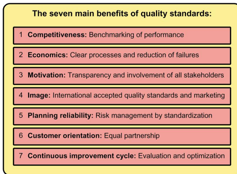
Figure 1: The seven main benefits of quality standards

Quality standards have got an impact in particular on seven main factors: The following figure lists these factors together with the main benefits of quality standards at a glance that can be identified in general related to the seven factors. 2